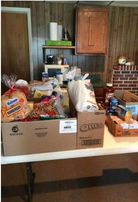
Perry Valley Grange provided financial help to purchase these food items for needy families.

We realize that we cannot save everyone, but the Grange is making a difference in our community by helping so many families. It is much like the man on the beach who was going along and picking up starfish and throwing them back into the sea. Along came a negative individual and said, "What good does it do for you to pick up the starfish?" "You can't possibly save all of them". The man bent over, picked up another starfish, threw it back and replied, "yes, but it made a difference to that one". That is exactly what your help is doing, making a difference!